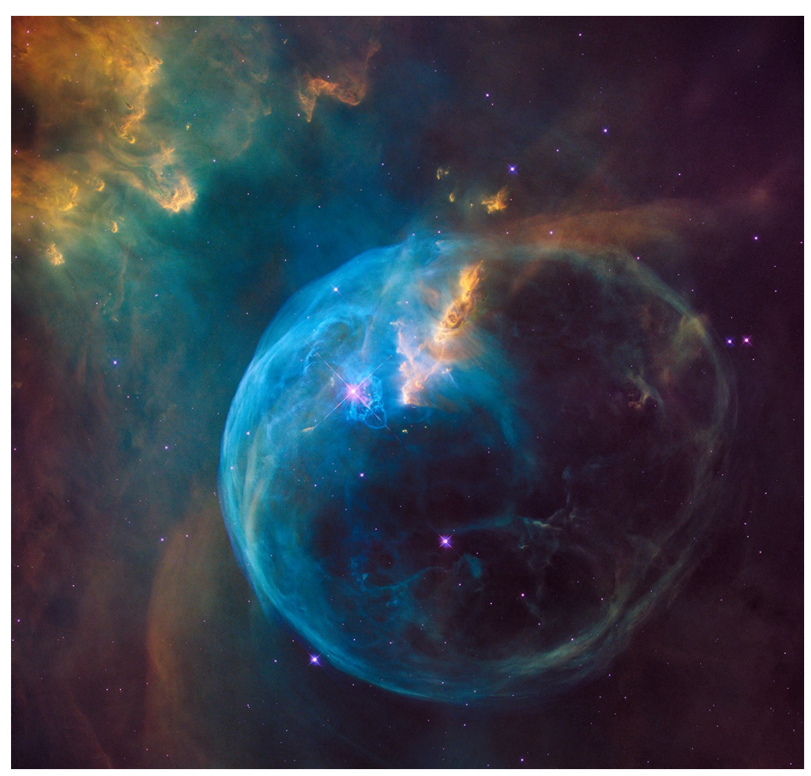
of the Bubble Nebula as imaged 229 years after its discovery by William Herschel.

The monthly newsletter of the Temecula Valley Astronomers July 2016